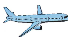
This Photo by Un-