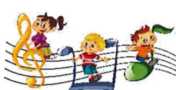
This Photo by Un-