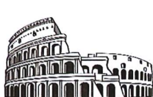
This Photo by Un-